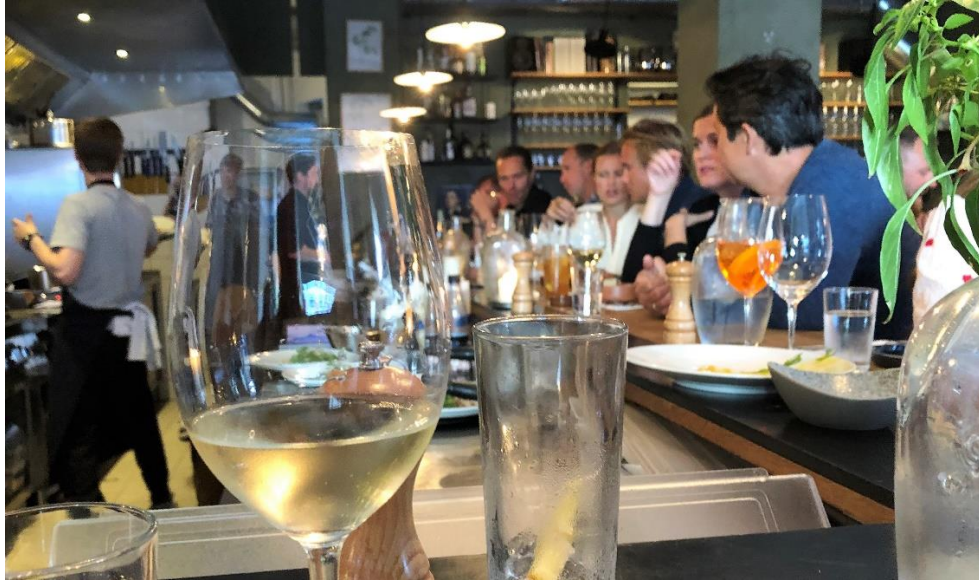
Restaurant Totto, Amagerbrogade

The local options – breakfast bread, coffee, ice cream, wine, pizza, take away restaurants